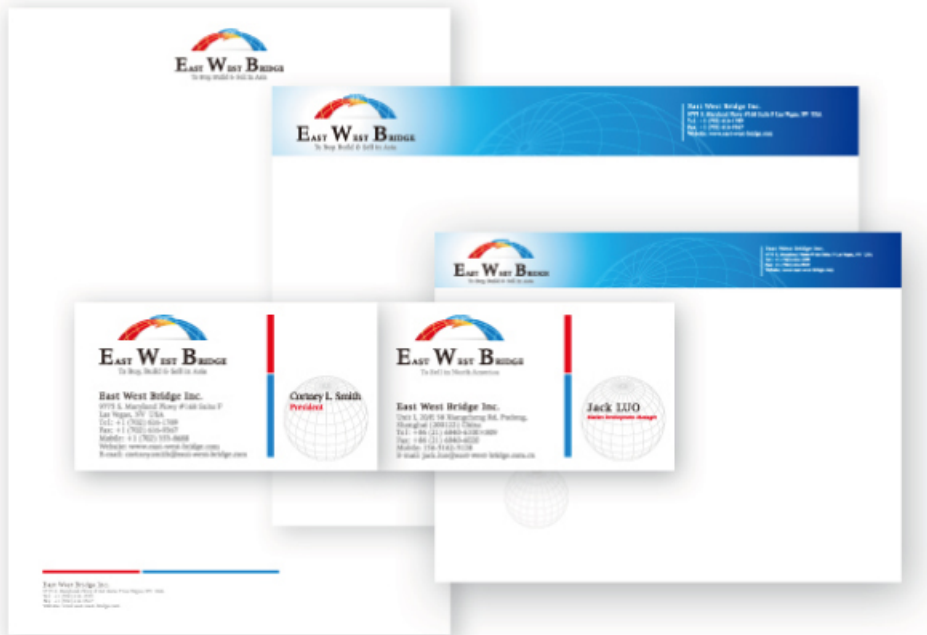
Above EAST WEAT BRIDGE Visual Identity System design

“To Develop the East-West Bridge through Positive Business Experiences”